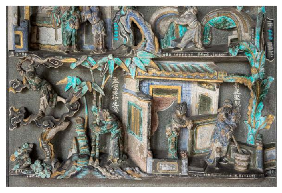
DECORATIONS DEPICT DAILY LIFE of the Khoo family, who were merchants by trade and can trace their roots back 650 years.

distinctly being in those spaces and the entire courtyard filling up with water," he says.