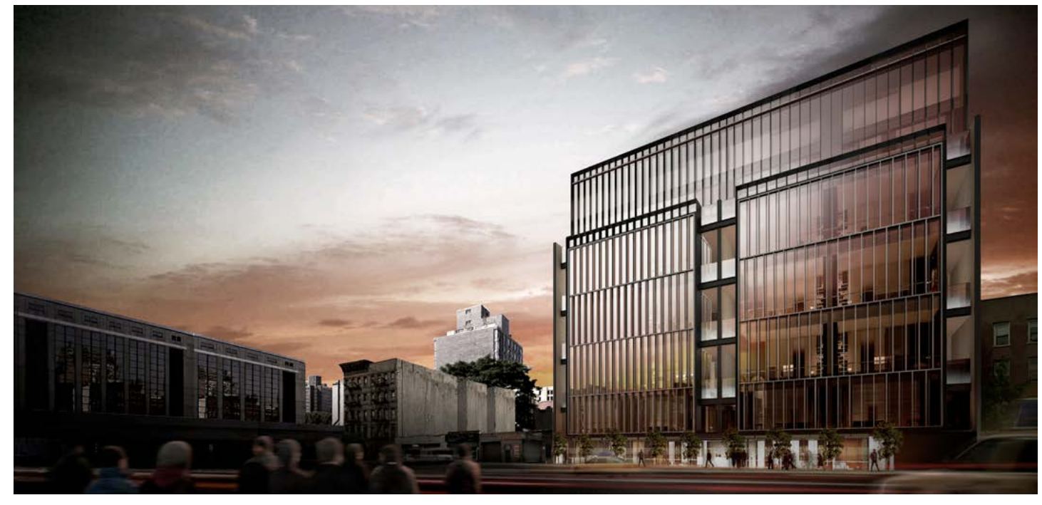
Condos With a Watery Theme

Condos With Pools and Huge Art Along the High Line