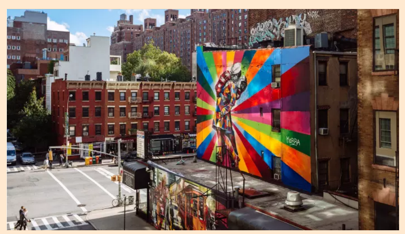
Colourful street art in Chelsea, Manhattan

Art galleries and new upmarket residential projects are reinforcing the appeal of this Manhattan neighbourhood