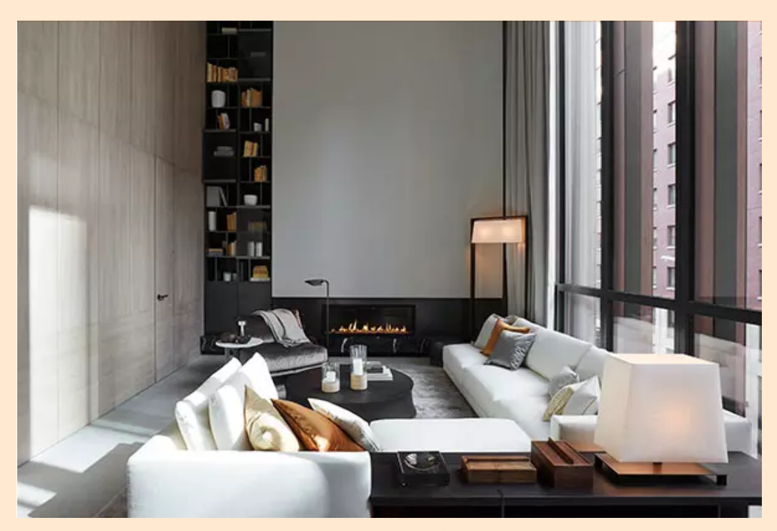
Apartment in Soori High Line, where a penthouse is priced $22.5m

These new properties differ in style and scope but most target the upper end of the market.