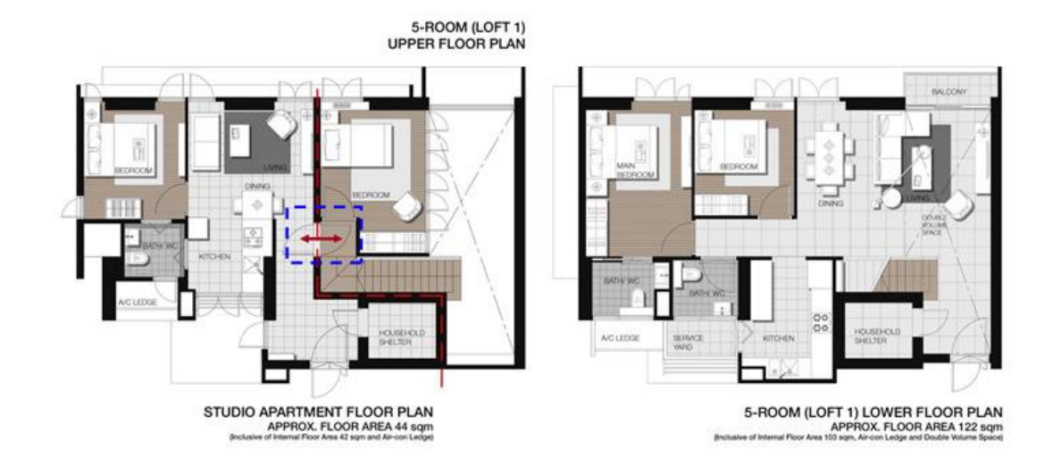
apartment floor plans