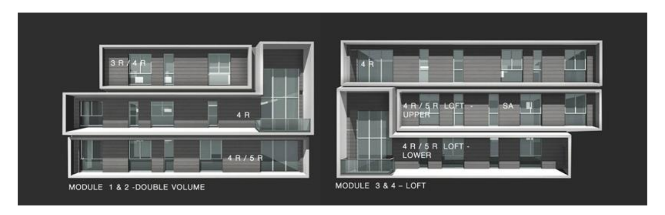
variations of module combinations