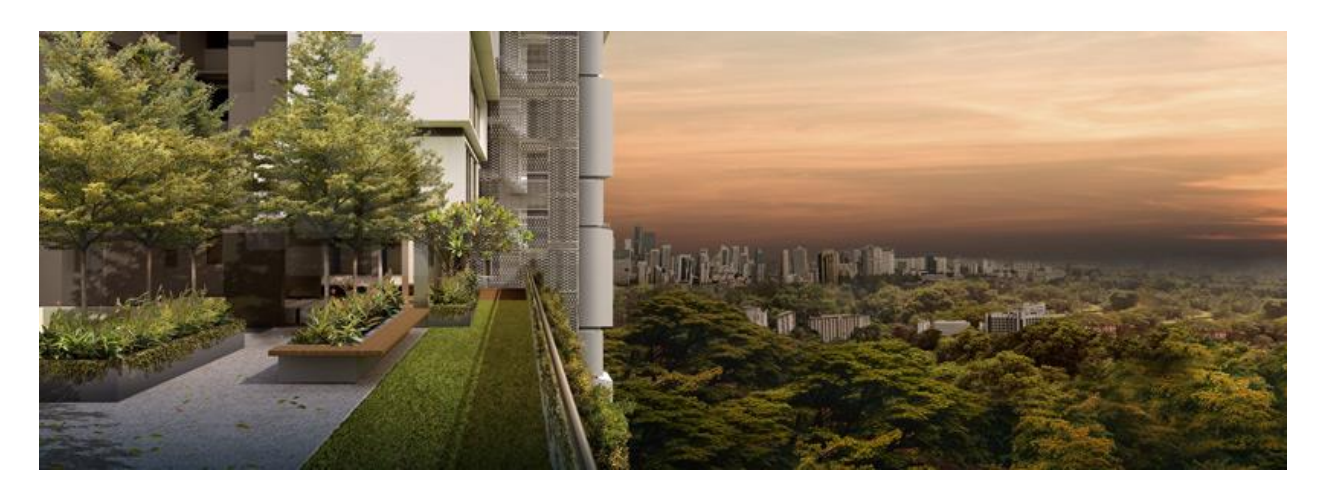
elevated green terraces link the towers and provide leisure space for occupants