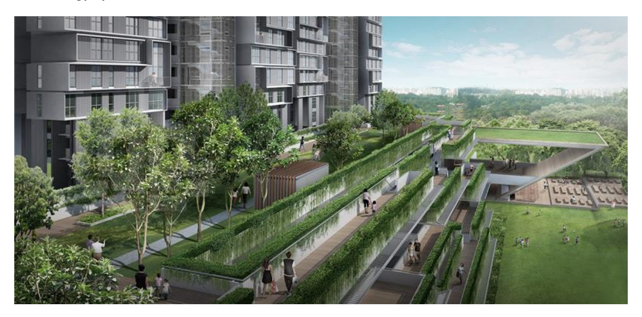
the series of terracing paths connect the buildings with the adjacent park

in may 2014, SCDA architects received singapore's 5-star award for residential high-rise architecture for the 'skyterrace@dawson' project. the design incorporates many ecologically conscious technologies, such as drip irrigation, rainwater harvesting, bio-retention basins and solar energy systems.