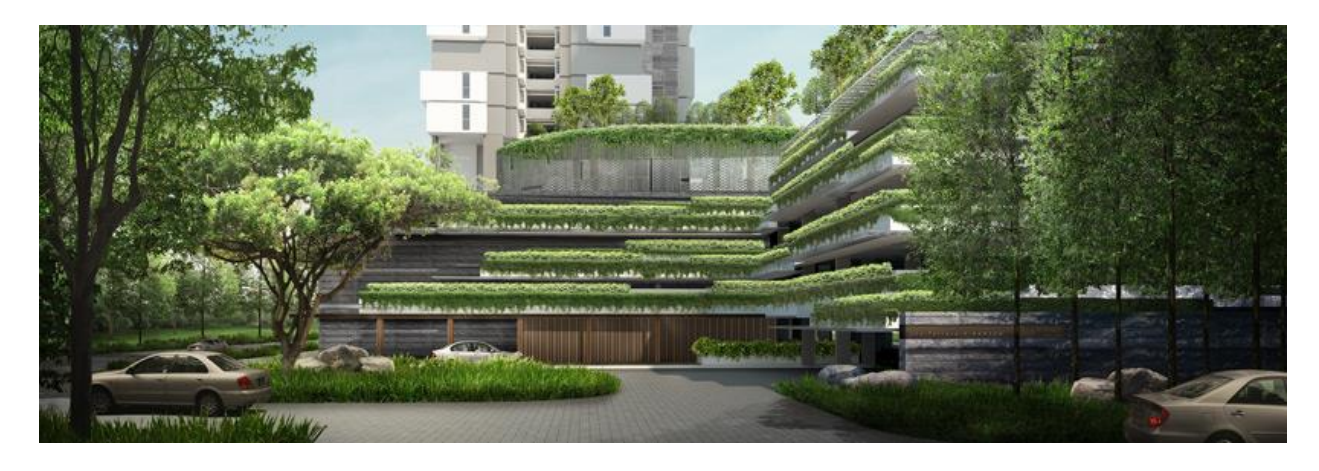
the five towers sit atop a parking podium