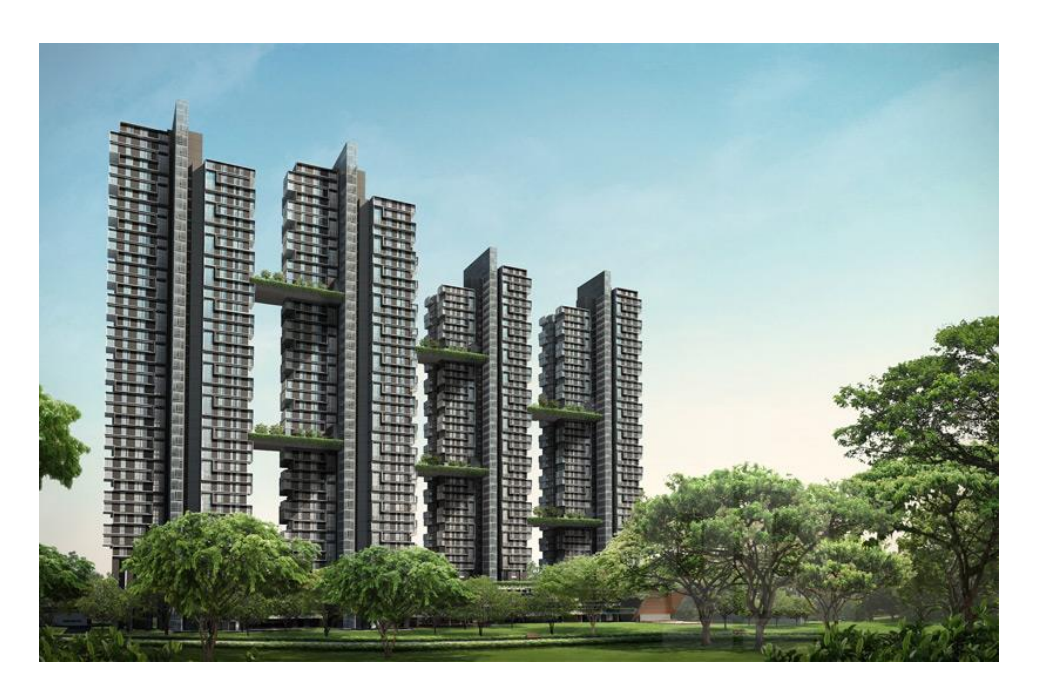
green bridges link skyterrace@dawson in singapore by SCDA architects

addressing singapore's need to expand public housing, SCDA architects have designed 'skyterrace@dawson', which is set to be completed in 2015. serving a country whose population increased from 4 million to 5.2 million from 2000 to 2011, the project is located near metropolis's downtown, in the area of dawson. the complex is composed of five towers ranging from 40 to 43 stories, and sits atop a podium containing parking. the scheme emphasizes a seamless connection to greenery, through lush landscaping on the ground plane as well as elevated gardens spanning between the separate buildings.