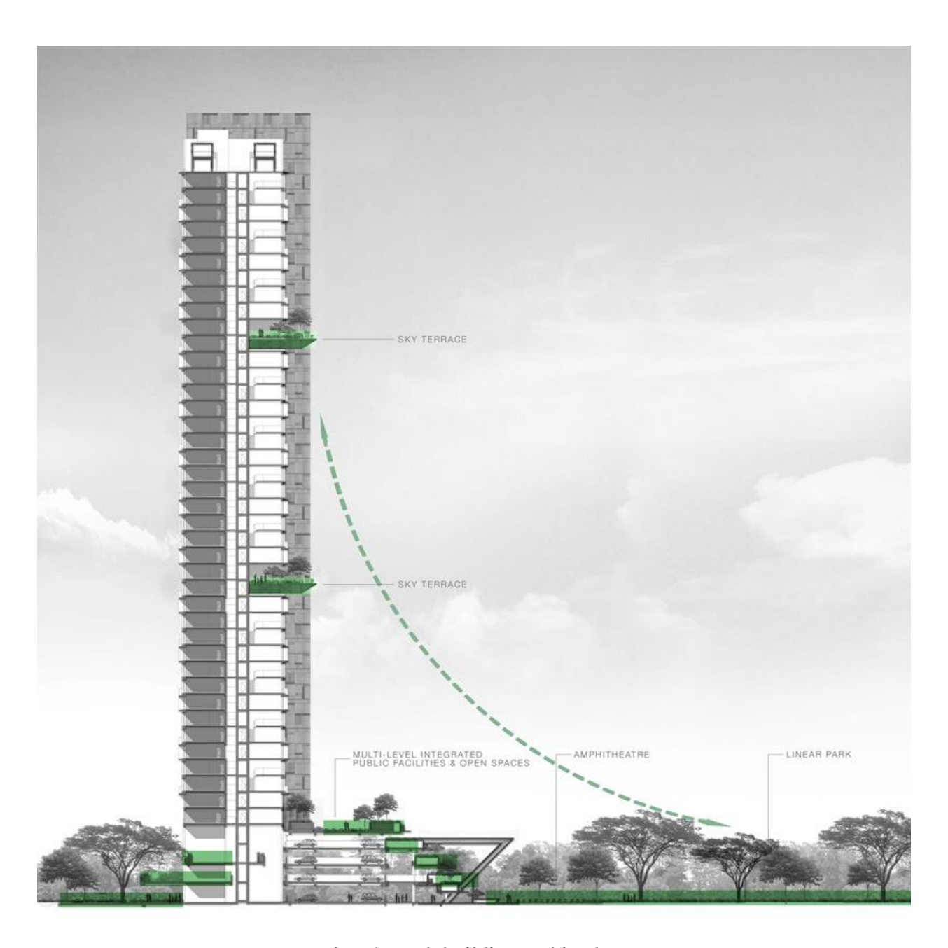
section through building and landscape