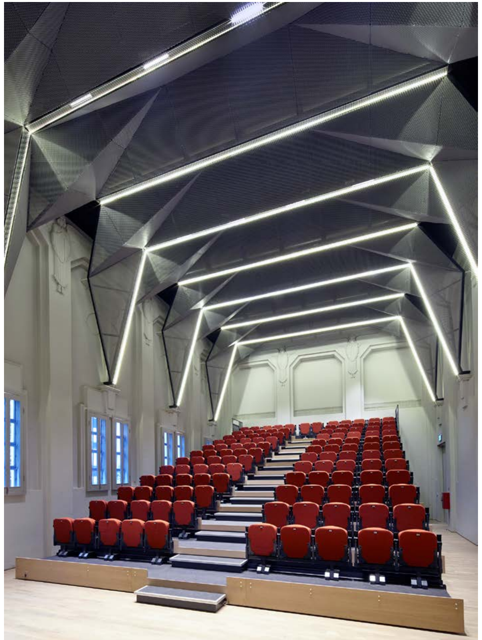
SCDA balanced heavy and light materials throughout the project, for example adding a folded metal-mesh ceiling to the muscular space that had once been the school's chapel and now serves as the auditorium.

Changes to the exteriors were subtle but important. The architects replaced old tiles with new ones on some roofs, repaired crumbling plaster, and installed new low-E glass in windows. To better connect the inside to pedestrian activity on Middle Road, they added a few new windows on the ground floor. A big challenge was designing a new entrance for the complex without disturbing the 5-foot-wide colonnade wrapping around its street-side facades. In the end, they chamfered one corner and inserted an angled Cor-ten wall announcing the NDC. It's a simple but dramatic move that exemplifies Chan's approach to design.