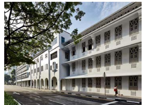
Three of the four buildings comprising the 85,000-square-foot NDC face Middle Road with the oldest on the right and the newest on the far left.

While mostly restoring the exteriors of the four buildings that make up the former Saint Anthony Convent school, Chan added and subtracted key spaces on the inside. The buildings—three of which date from the 1920s and '30s and the fourth from the '40s—represent a range of styles from British Colonial to Moderne. They sit in the Bras Basah/ Bugis part of town, a few blocks from the historic Raffles Hotel and across the street from Ken Yeang's National Library. Three of the structures line up along busy Middle Road and are connected inside, while the fourth sits behind them on quieter Queen Street, separated by just a driveway. The NDC serves as the home of the DesignSingapore Council, the national