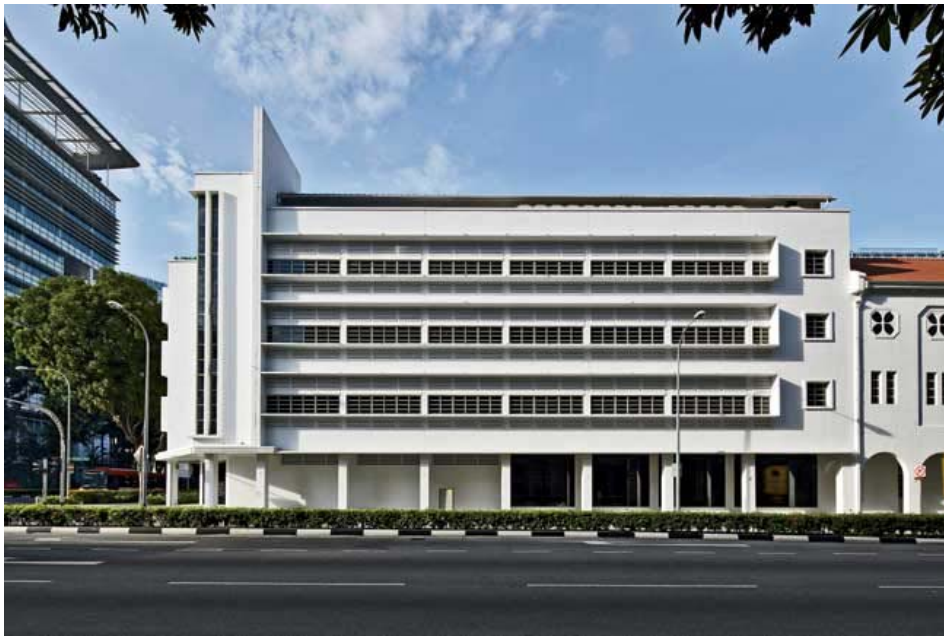
The newest of the four buildings comprising the NDC occupies the east end of the site and dates from the 1940s.

Religious conversion: Once a Catholic school, a set of buildings from different decades of the 20th century has been transformed into a modern design hub.